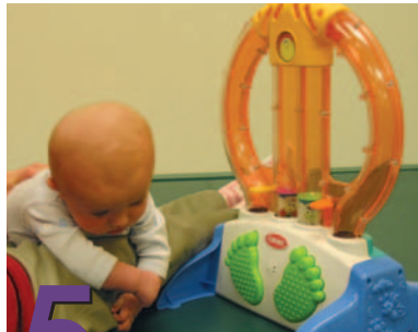
5 More Activities