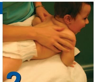
2 Dressing and Bathing