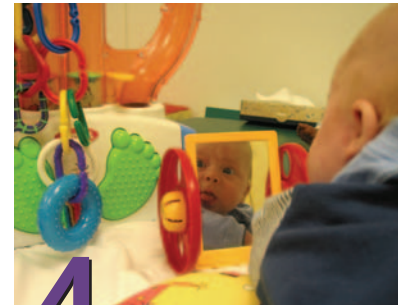
4 More Activities