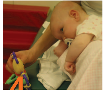
4 Positions for Play