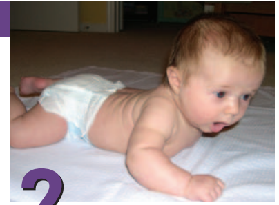
2 More Activities