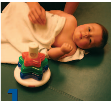
1 Dressing and Bathing