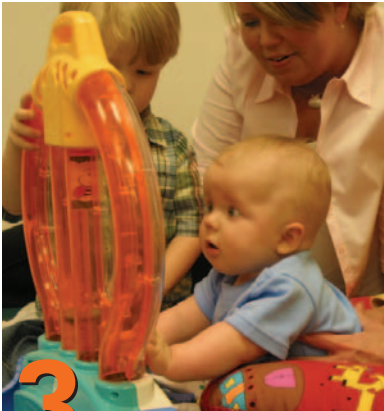
3 Positions for Play