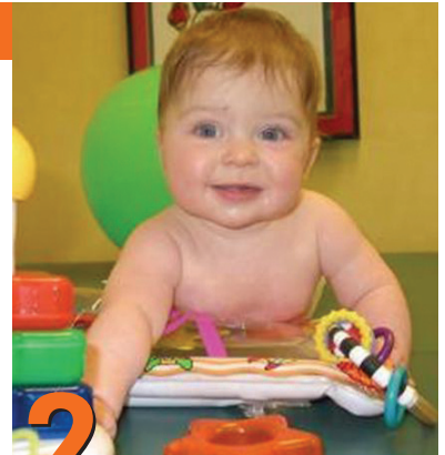
2 Positions for Play