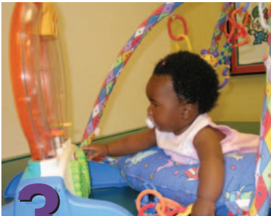
3 More Activities