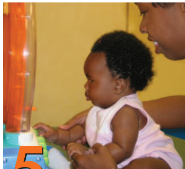
5 Positions for Play